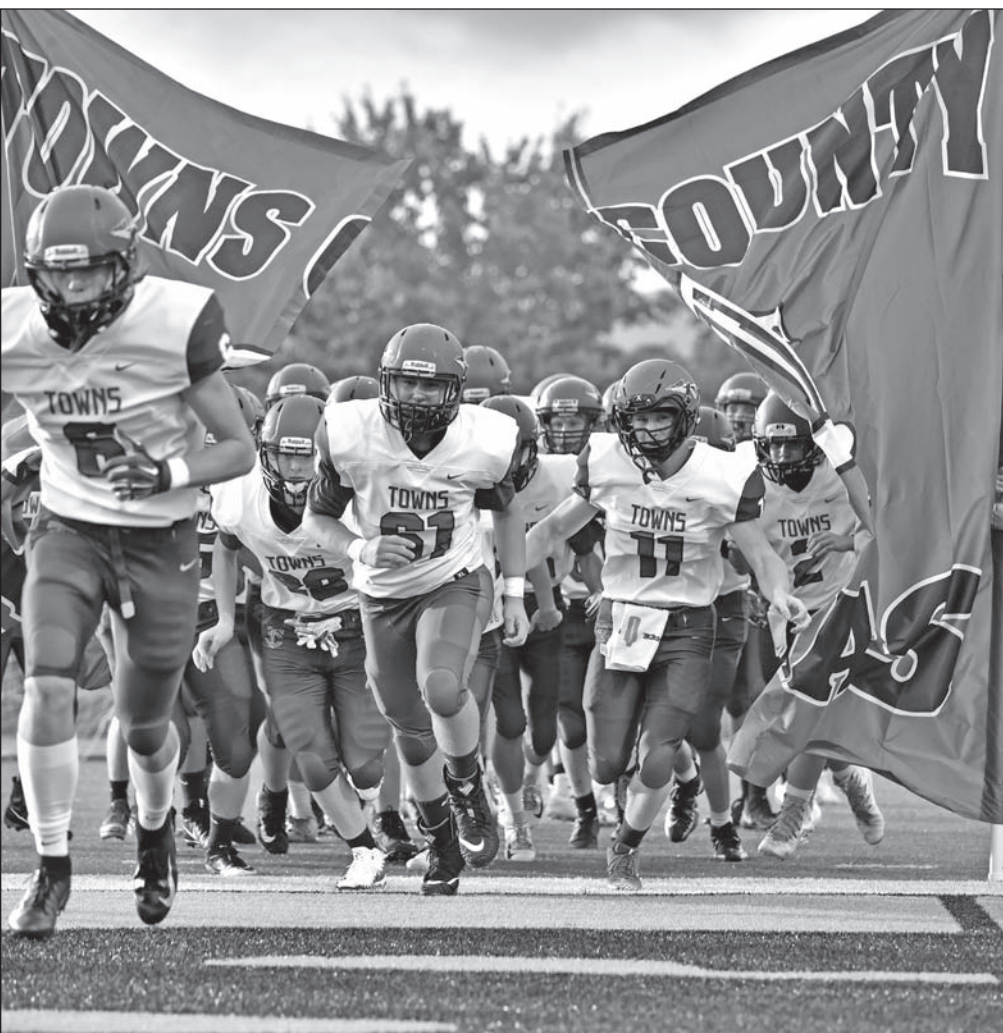
Towns County will host 3rd ranked Commerce this Friday for Senior Night. Everyone is encouraged to come out to Frank McClure Stadium to thank the senior class for all of their hard work.